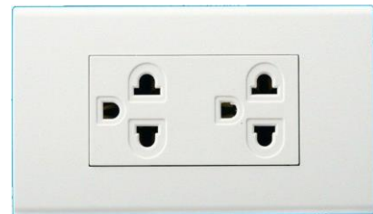
(A, B, & C Compatible)