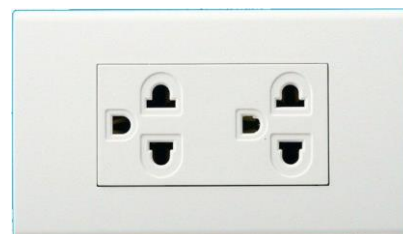
(A, B, & C Compatible)